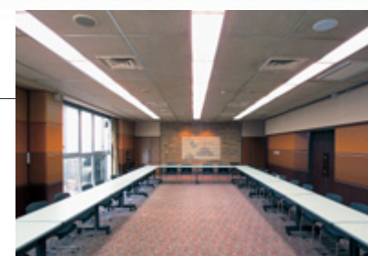
Large Conference Hall

This room can be used for exchange events, lectures, meetings, trainings, small parties and other events.